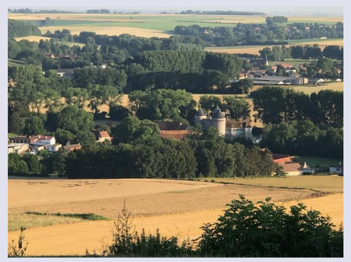
La Grande Découverte